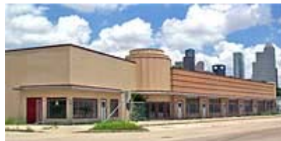
NMCA is trying to save the Settegast Building on West Gray from demolition.